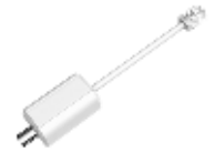
LR1002 ePoE Over Coax Converter