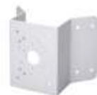
PFA151 Corner Mount