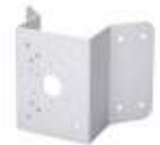
PFA151 Corner Mount