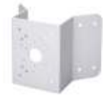
PFA151 Corner Mount