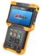
PFM900-E Integrated Mount Tester