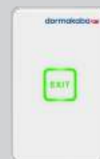
9009MAXW Order No. 9400000011763 (Activated mode shown)