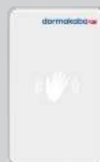
9009MAHW Order No. 9400000011759 (Standby mode shown)