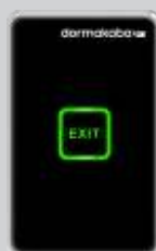
9009MAXB Order No. 9400000011762 (Activated mode shown)