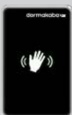
9009MAHB Order No. 9400000011758 (Standby mode shown)