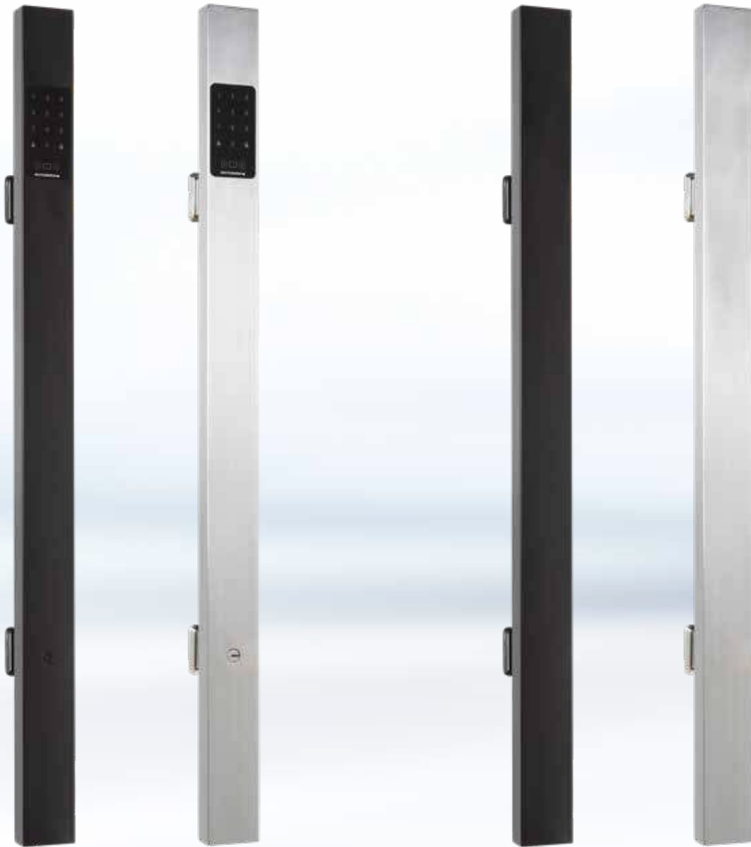
Entrance Pull Handles