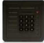
ProxPro® with Keypad