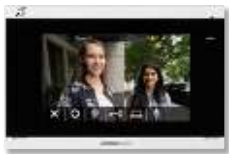
IXG-2C7-L IP Video Tenant Station with T-Coil Compatibility