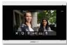
IXG-2C7 IP Video Tenant Station