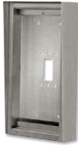
SBX-IXGDM7 Surface Mount Box for the IXG-DM7-HID