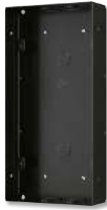
IXG-DM7-BOX Flush Mount Box for the IXG-DM7-HID