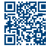
IXGW-GW IXG Series Mobile App Gateway Adaptor

Gateway required for mobile app. Sold separately.