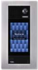
IXG-DM7-HID IP Video Entrance Station

Scan QR codes for more detailed information