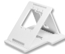
MCW-S/B Desk Stand for IXG-2C7 or IXG-2C7-L