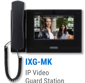
IXG-MK IP Video Guard Station