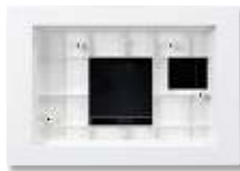
IXG-FMK-2C7 Flush Mount Kit for IXG-2C7 or IXG-2C7-L