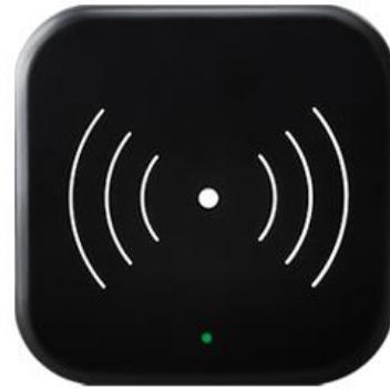
Card Reader/ Encoder x1