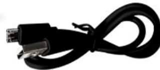
USB Cable x1