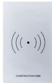
RFID Card x3