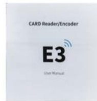
User Manual x1