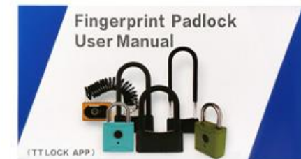
User Manual × 1