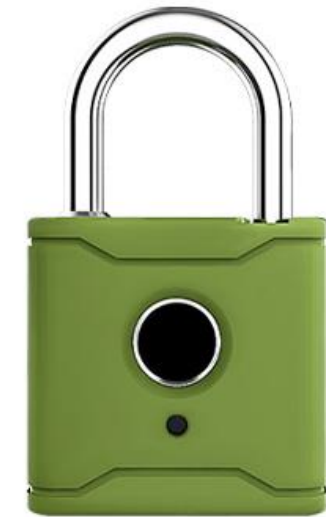
Padlock × 1