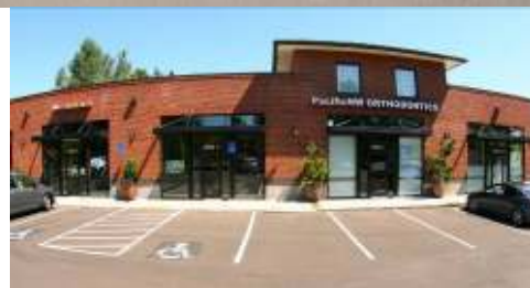
Typical wide angle lens