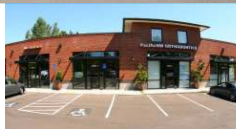
Typical wide angle lens