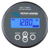
Bluetooth sensing BMW-712 Smart Battery Monitor