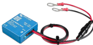
Bluetooth sensing Smart Battery Sense