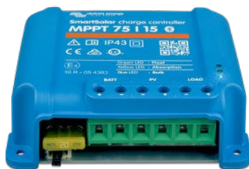
SmartSolar Charge Controller MPPT 75/15