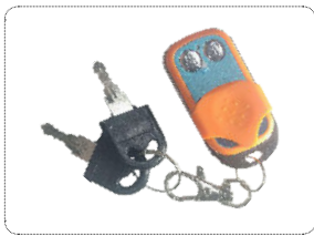
Remote control and keys