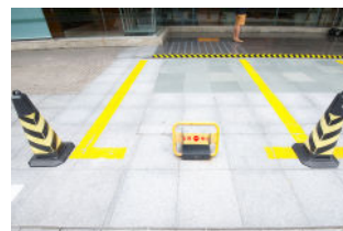
Private parking management